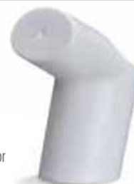
Rexam 6868 standard applicator

Two standard applicators, 6868 and 6870, are compatible with Inhalia™ valves.