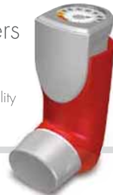
Customer specific pMDI with a dose counter for 120 or 60 doses

Rexam's powerful Innovation and Development capabilities and first-class quality system are key assets on the road to success.