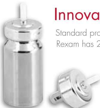
Inhalia™ valves for pMDI available in acetal (POM) or PBT with different gasket materials

Rexam has 25 µl, 50 µl and 63 µl valves available with a dose tuning capability up to 140 µl.