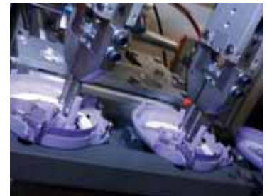
Fully automated assembly line for a Dry Powder Inhaler

Rexam brings global injection capabilities, automation/assembly performance, inline quality control, cGMP and FDA compliant process validation.